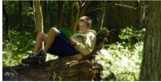
Students explore the outdoors through Seventh Grade Outdoor Education.